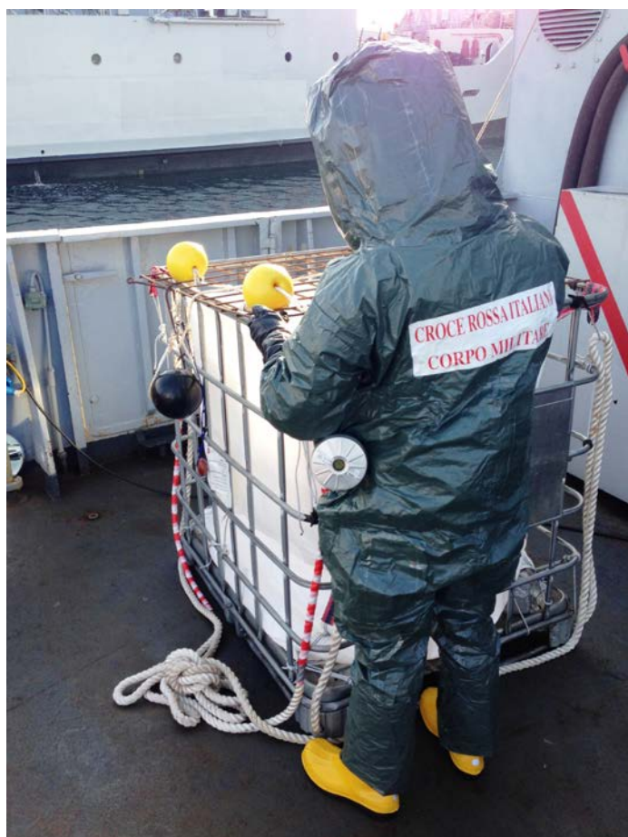
Figure 2. “Tremiti” Italian Navy Vessel, ItRC MC Operator / Protection recommended measures in biocontainment environment – Tyvek suit and PAPR – rear view.

Dead Bodies Unit. It is deployed with the aim to promote the proper and dignified management of dead bodies and to maximize the identification (DVMI) in order to apply the humanitarian principles and the right of the families to know the fate of