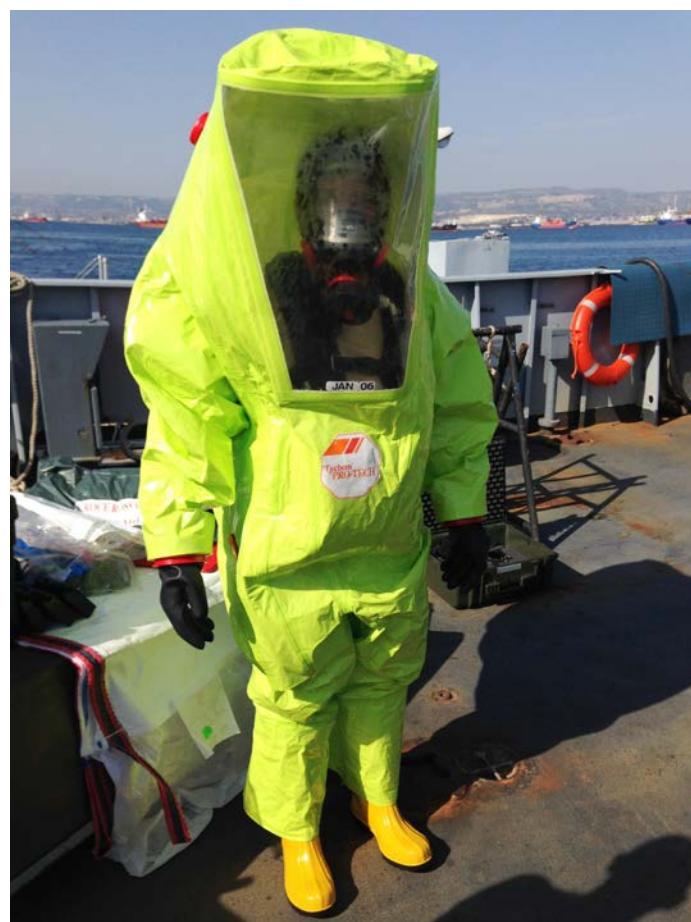
Figure 3. ItRC MC Operator dressing an entire protective suit for HAZMAT category.