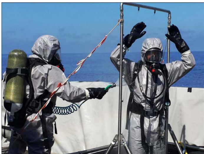
Figure 4. ItRC MC Operator Operational Decontamination / ItRC MC Operator with man portable CBRN decontamination equipment.

the relatives. In case of disaster/major incident ItRC MC DVMI Operators recovery human remains reconstructing each one inside a bag, called “body bag”, being identified it uniquely with special alphanumeric code, called “DVI”, decontaminating the